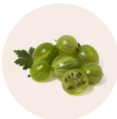
Indian Gooseberry ( amla )